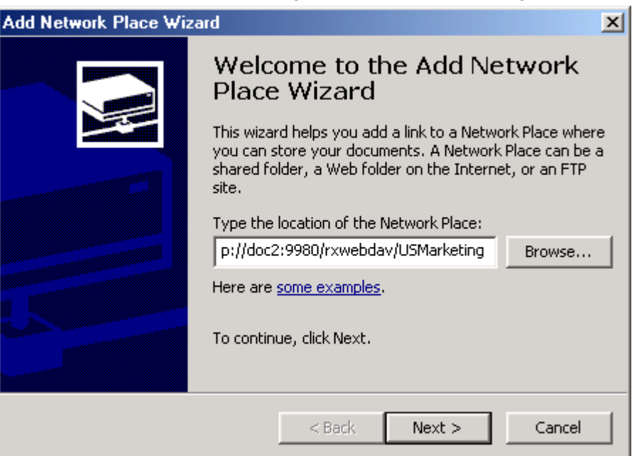
Figure 6: Add Network Place Wizard

8 Now, we can create Network Places in Windows Explorer (see "Opening Web Folders in Windows Explorer" on page 16) that make these Rhythmyx folders available through Windows Explorer. We start Tomcat. In the Add Network Place Wizard, we enter the locations for our WebDAV servlets in the format http://localhost:<appserver port>/<WebDAV application>/<servlet URL pattern>. The servlet URL pattern is specified in the root parameter of the <PSXWebDAVConfigDef> element of the configuration file.